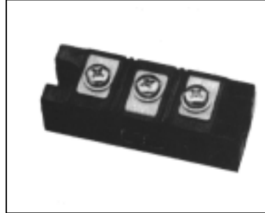
QR_3310002 Fast Recovery Diode Module 100 Amperes / 3300 Volts