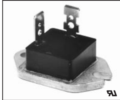
CS340602, CS341202 Fast Recovery Single Diode Modules 20 Amperes/600-1200 Volts