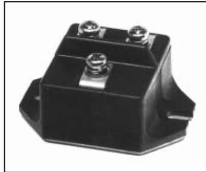
CN24_ _020N, CC24_ _020N Super Fast Recovery Dual Diode Modules 20 Amperes/300-600 Volts