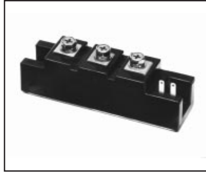
CM4212A2, CM4216A2 SCR/Diode POW-R-BLOK™ Modules 25 Amperes/1200-1600 Volts