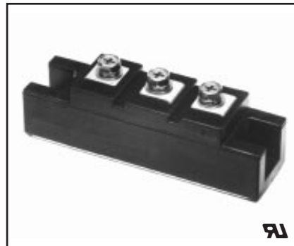
CD411230, CD411630 Dual Diode POW-R-BLOK™ Modules 30 Amperes/1200-1600 Volts